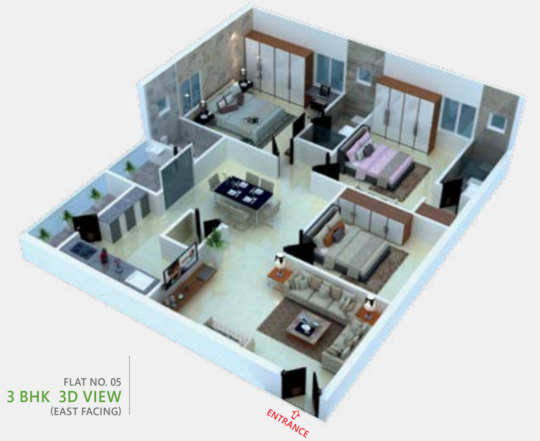
FLAT NO. 05 3 BHK 3D VIEW (EAST FACING)