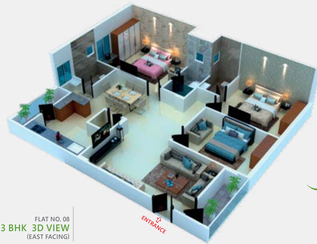
FLAT NO. 08 3 BHK 3D VIEW (EAST FACING)