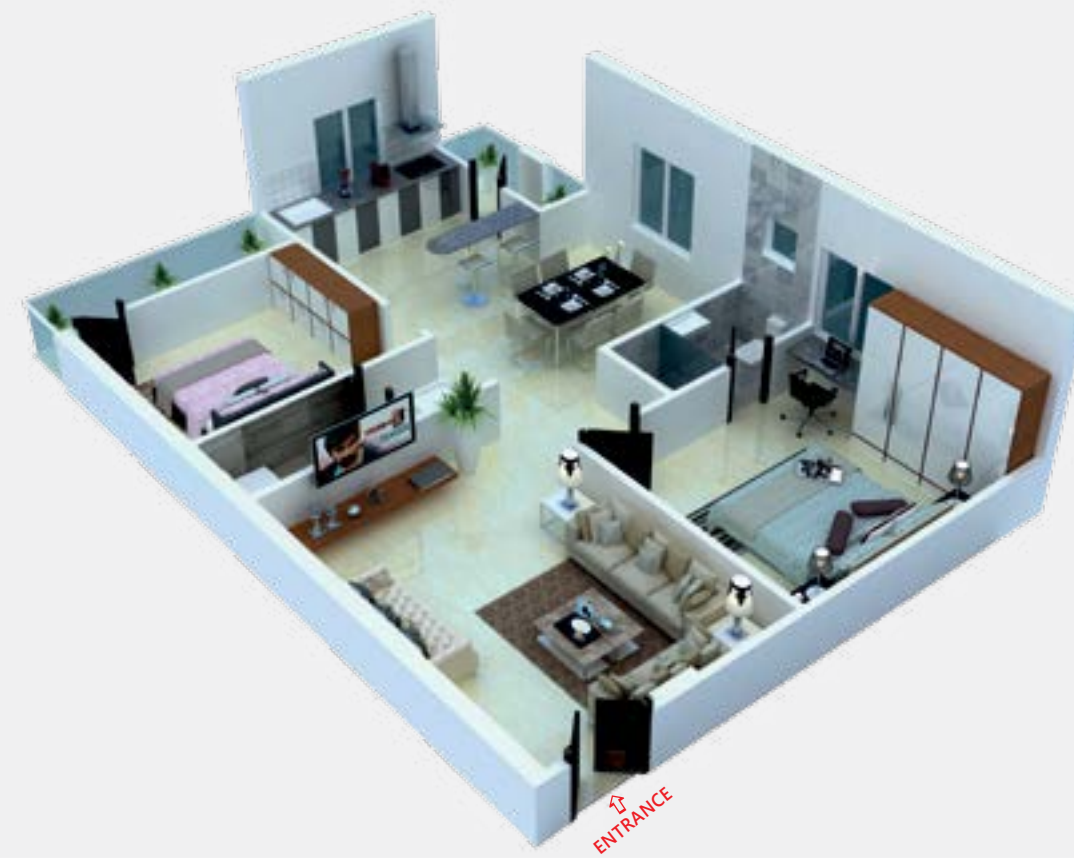
FLAT NO. 01 2 BHK 3D VIEW (WEST FACING)