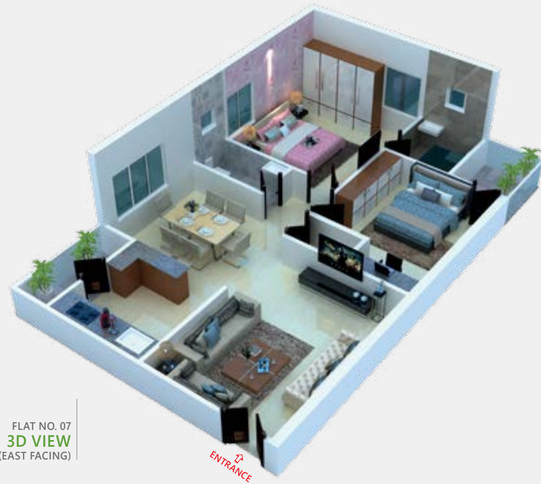
FLAT NO. 07 2 BHK 3D VIEW (EAST FACING)